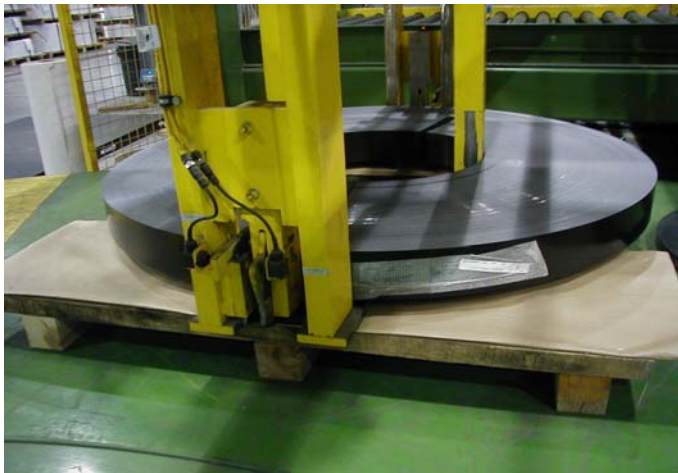
OD and ID forks