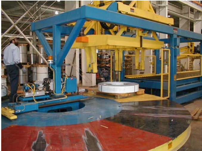
Overhead carriage with VFD