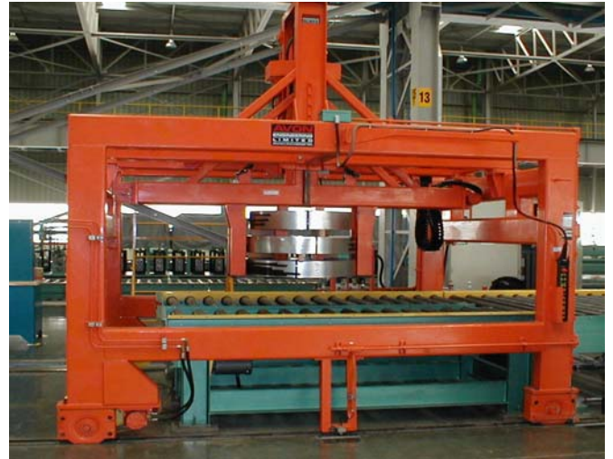
Travel lift stacker