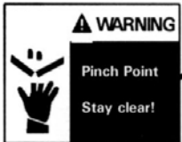
One at each corner