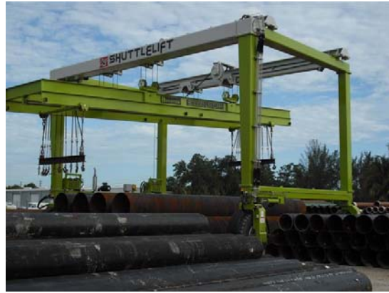
Hydraulically adjustable spreader beams for outdoor storage