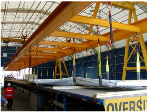
Extra long and extra wide spreader beams for handling towers and blades