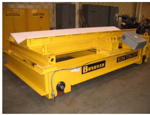
High capacity transfer cars for bay-to-bay transport