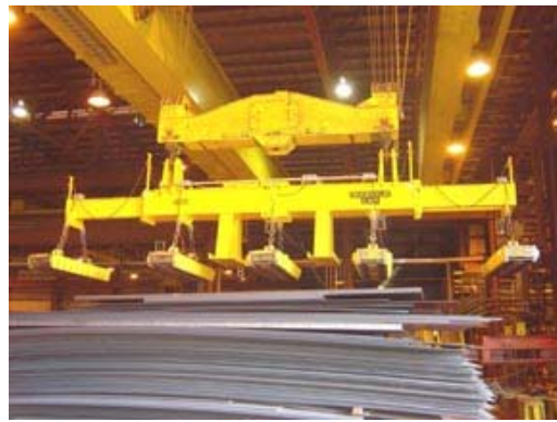
Telescoping plate handling magnet beams