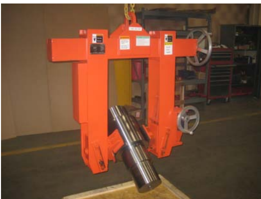
1,500-pound hand wheel operated rotating axis grab lifts and rotates machined gearbox parts around their horizontal axis.