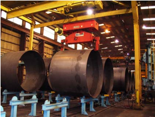
Grab for lifting and rotating pipe (tower) sections